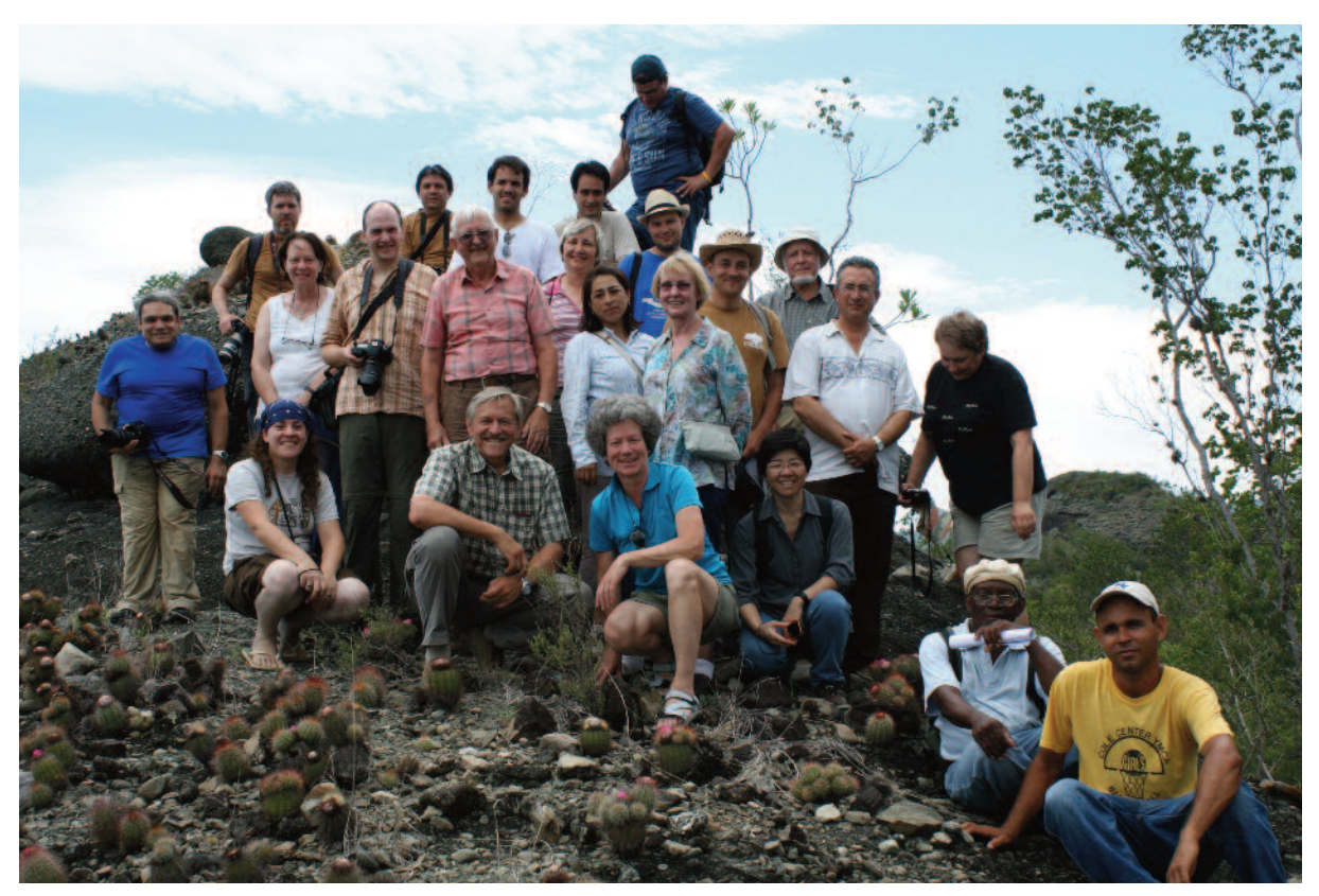
Post-Congress tour participants at Los Monitongos Reserve, Guantanamo, Cuba