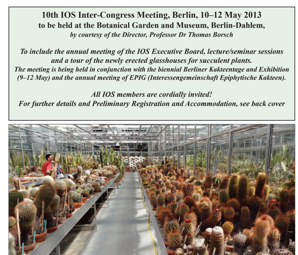
New accommodation behind the scenes for succulents at the Berlin-Dahlem Botanical Garden